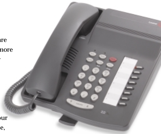
The 6408+ is an entry-level feature/function telephone.

Most models also have flexible feature buttons and four “navigator” keys indicating Menu , Next , Previous , and Exit , as