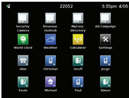
9670G home screen

Gigabit Ethernet and Bluetooth: integrated and ready to go. The Avaya 9670G comes equipped with Gigabit Ethernet and Bluetooth, streamlining the phone and simplifying operations and support for